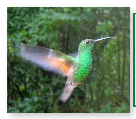
Every day comes bearing precious gifts for us from God. We need to untie the ribbon and choose to live thankfully.